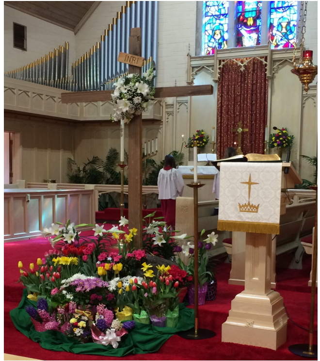
Flowers under the cross Easter Sunday 2016

If you would like to honor a loved one in the Easter bulletin with a plant to be placed beneath the cross, please write it down your request and email it, or drop it off in the office by April 7th. Easter is April 16th this year.