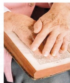
MAUMEE VALLEY CONFERENCE - WOMEN OF THE ELCA ANNUAL SPRING ASSEMBLY St. Peter's Lutheran Church 710 Joe E. Brown Avenue - Holgate, Ohio April 14, 2018

The WELCA Spring Assembly was held on April 14 th at St. Peter Lutheran Church in Holgate. Even though it was a rainy stormy day, there were many smiles to greet me. We were invited to have an informal buffet breakfast to relax and chat with friends before starting the morning service. The coffee cake was tasty and the warm tea made me forget about the dreary weather.